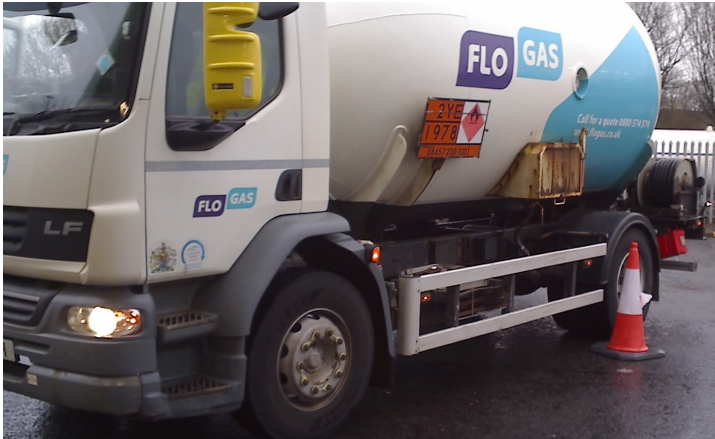
LowPressure Gas aka FloGas or AutoGas being delivered at one of 1,500 LPG filling stations in the UK

Despite showing a valid disabled person's Blue Badge, this campaigner still got a parking ticket from a platoon of Westminster Council civil enforcement wardens sent out especially to ticket cars at the demonstration