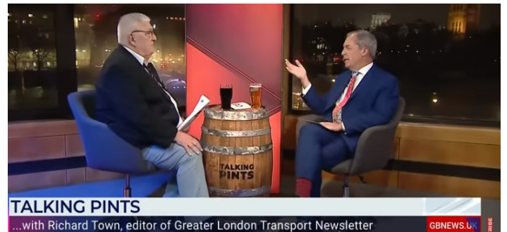
GLTN interviewed by Eamonn & Isobel on their breakfast show. And with Nigel Farage. GB News continues to provide balanced reporting of the campaign with Lawrence Fox and other hosts keeping viewers up to date